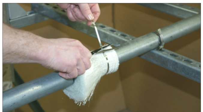
Use the stainless steel cable tie supplied or wire to prevent the fabric unrolling in the event of a fire