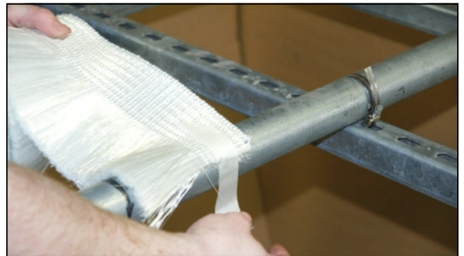
Pre-cut some short lengths of self adhesive tape to aid fixing, apply a length to the Brushseal then adhere to the penetration ensuring the bristles are aligned with the mark and then start the wrapping process