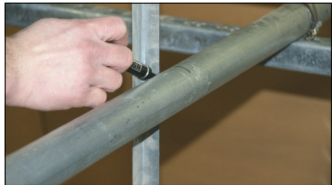
Using a straight edge mark the penetration where it will meet the fire barrier as shown above