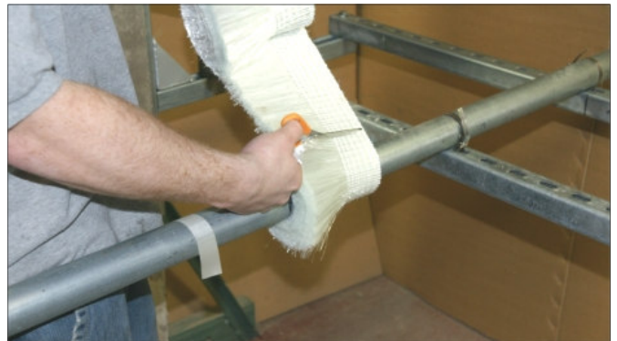
Wrap to a minimum of 5 layers and cut the seal fabric as shown then secure the seal with the self adhesive tape.